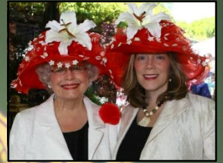
ST. JOHN ANNE FONTAINE TORY BURCH